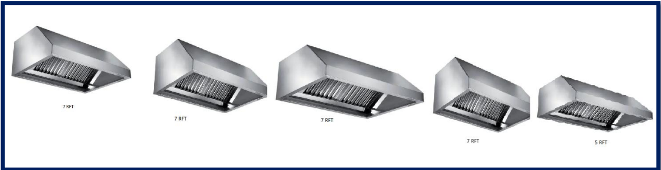
(i) 7 RFT (ii) 7 RFT (iii) 7 RFT (Representational image) (iv) 7 RFT (v) 5 RFT

The items covered under scope of works shall include all those ancillary items which may be required to complete the work in all respect whether specially mentioned or not